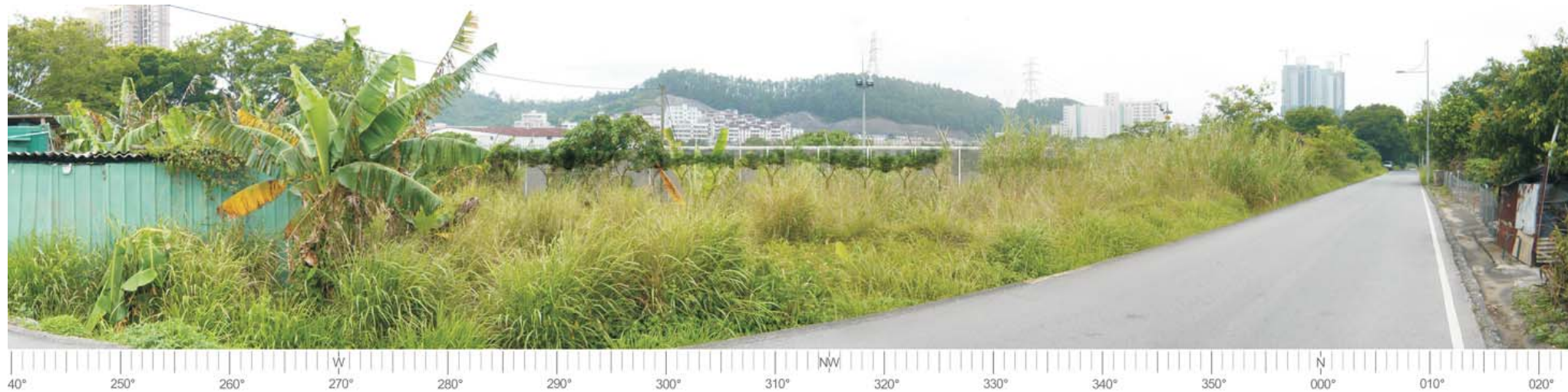
View displaying the 3D Model of the Project with Mitigation at Day 1 Operation