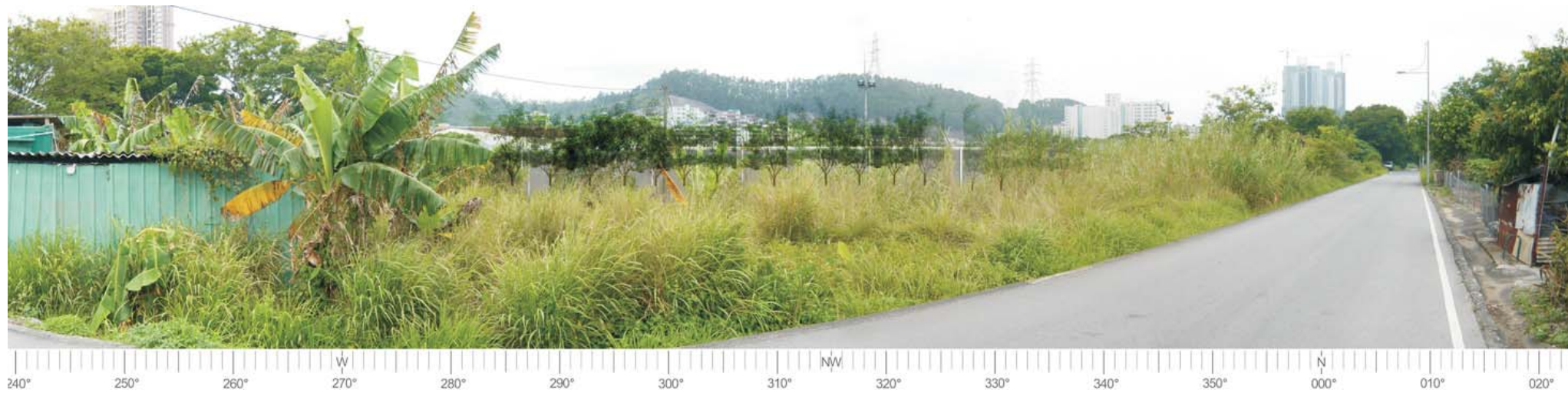
View displaying the 3D Model of the Project with Mitigation at Year 10 Operation.